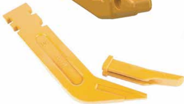
Scarifier Shank and tip